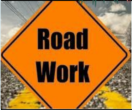
Road Resurfacing JULY 1-3

Seal coating will take place on July 1-3 on the western two blocks of Eastview Dr., Gateway Dr. and Vista Pointe Dr., as well as the north two blocks of Sky Ranch Rd. and Meadowood Ln. A map detailing the schedule is on the next page.