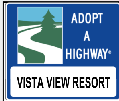
Adopt-A-Highway JULY 26 7:15 a.m.

Trivia Night will be held on Tuesday, July 15 from 5-7 p.m. You'll need a team of up to six players to compete - and maybe win a prize! Sign up in the office by 10 a.m. July 8. This event is open to VVR residents only.