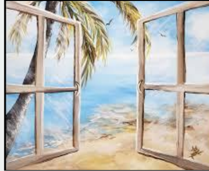
Paint Party Tropical Window JULY 22 4 p.m.

Seal coating will take place on July 1-3 on the western two blocks of Eastview Dr., Gateway Dr. and Vista Pointe Dr., as well as the north two blocks of Sky Ranch Rd. and Meadowood Ln. A map detailing the schedule is on the next page.