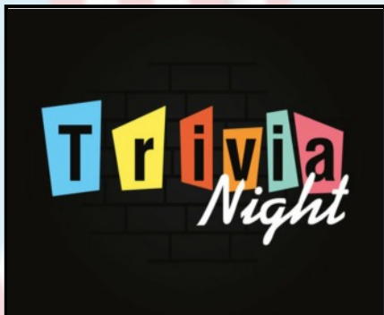
Trivia Night JULY 15 5-7 p.m.

You're invited to our sip and paint night on July 22 at 4 p.m. Bring a drink of your choice; all painting supplies and guided instruction - as well as a light dinner are provided. Sign up deadline is July 15, 10 a.m. Residents: $10; guests: $20.