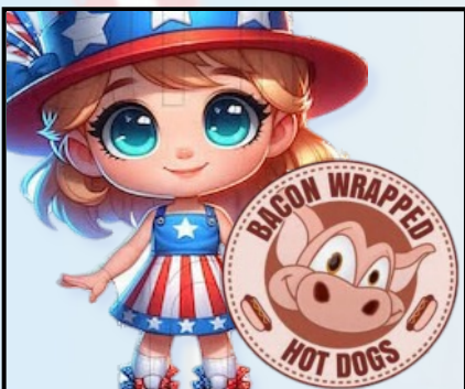
Pot Luck Supper Patriotic Picnic JULY 18 4:00 p.m.

Interested in joining the Adopt-A-Highway cleanup crew? They plan to head out at 7:30 a.m. on July 26. Meet at the clubhouse at 7:15 if interested.